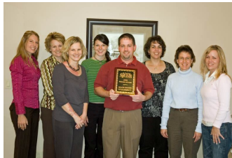
Meade County Title Co. receives a Heroes Plaque