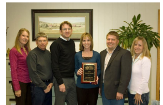
Belle Butte Title Co. receives a Heroes Plaque

Without the support from organizations like theirs, REALTORS for Kids would not be able to touch so many children.