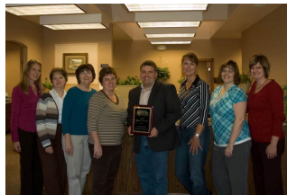
Lawrence Title Co. receives a Heroes Plaque

helping REALTORS for Kids, Inc. make a difference in children's lives and makes them our HEROES.