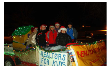
Children enjoyed the RFK float in this year's Parade of Lights

ganization to support the children in the Northern Hills. A special thanks to all those that volunteered to help with this wonderful event.