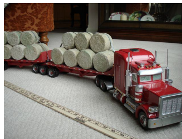
Check out this hand carved wooden hay truck, it's 3 feet long